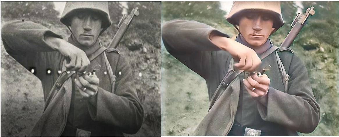
Restoration and Colourization of a WW1 footage from 1917 (from our trailer)

Restoring the Holocaust to full HD and in colour